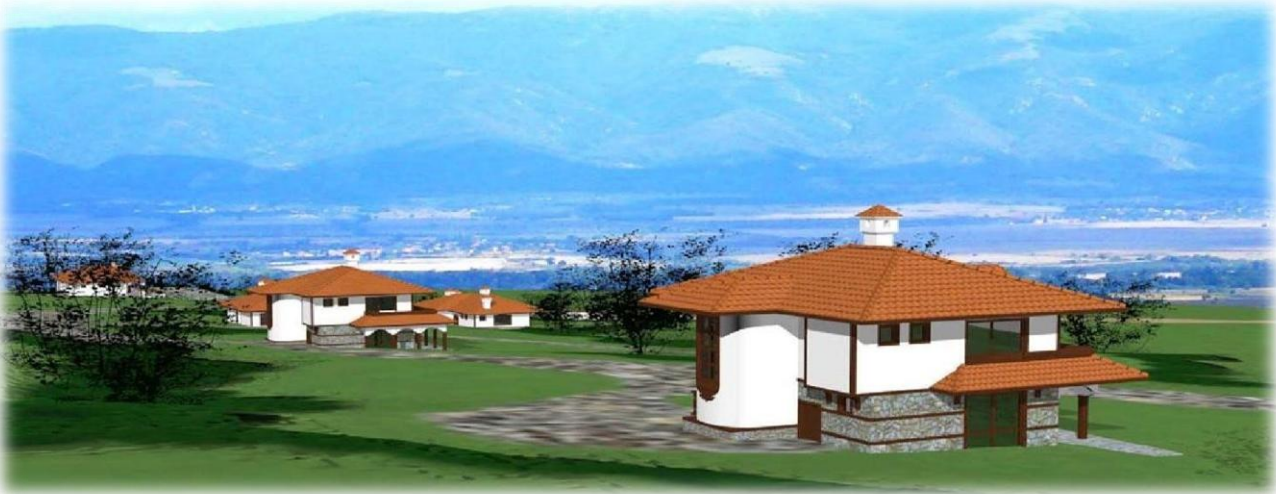
The plot is located in the foothills of Sredna Gora mountains between rose and lavender gardens, in a quiet area with beautiful panoramic view to Stara Planina mountains.