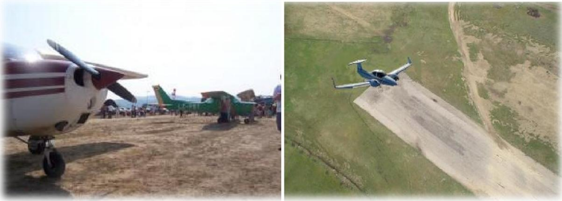
The location of the land in Bulgaria

Two air strips are located 5 km in northern direction and 18km to the south of the land.